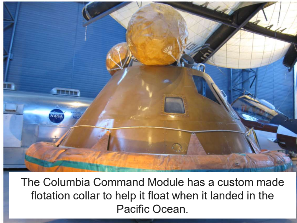
The Columbia Command Module has a custom made flotation collar to help it float when it landed in the Pacific Ocean.

After 22 hours on the Moon, Armstrong and Aldrin returned to the command module using Eagle. The Apollo 11 crew returned to Earth and landed in the Pacific Ocean on 24 th July. The module had a special heat shield which stopped it from burning up as it travelled through the Earth's atmosphere.