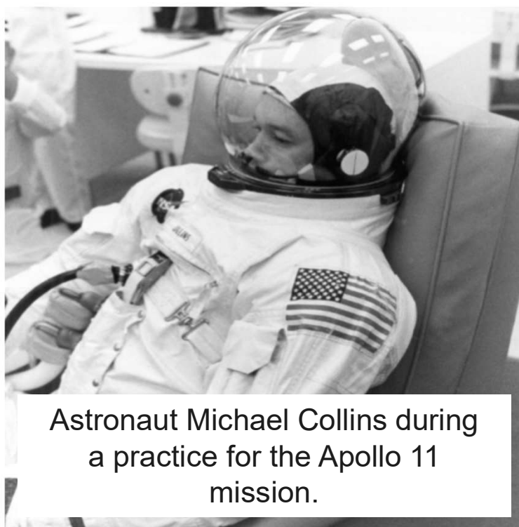
Astronaut Michael Collins during a practice for the Apollo 11 mission.

Three astronauts were on board Saturn V: Neil Armstrong, Michael Collins and Edwin “Buzz” Aldrin . The astronauts had to go through lots of training to move around in their bulky spacesuits, and test all the spacecraft’s equipment.