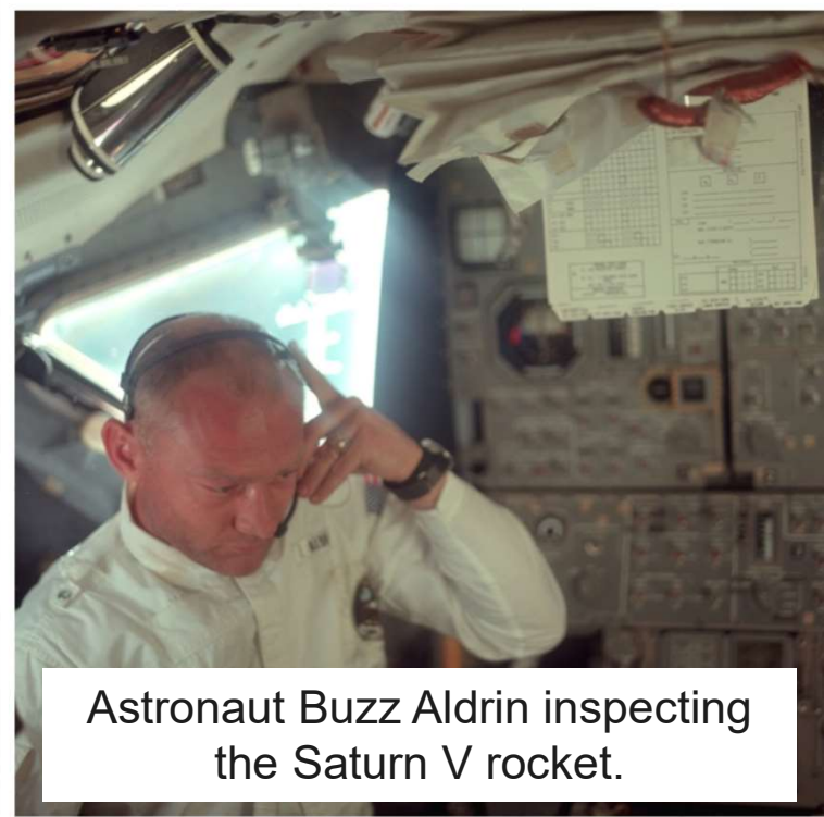
Astronaut Buzz Aldrin inspecting the Saturn V rocket.