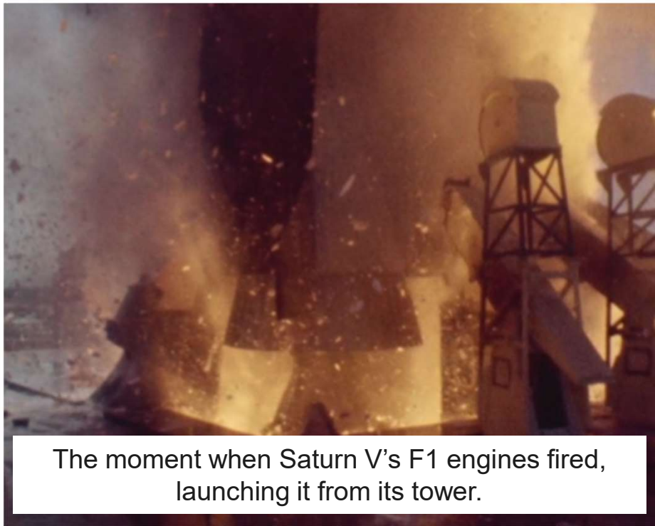
The moment when Saturn V's F1 engines fired, launching it from its tower.

On launch day, Collins, Armstrong and Aldrin sat at the very top of Saturn V in the command module. At 9:32am Saturn V's engines fired and the rocket launched off from its tower. Twelve minutes later, the astronauts were orbiting Earth.