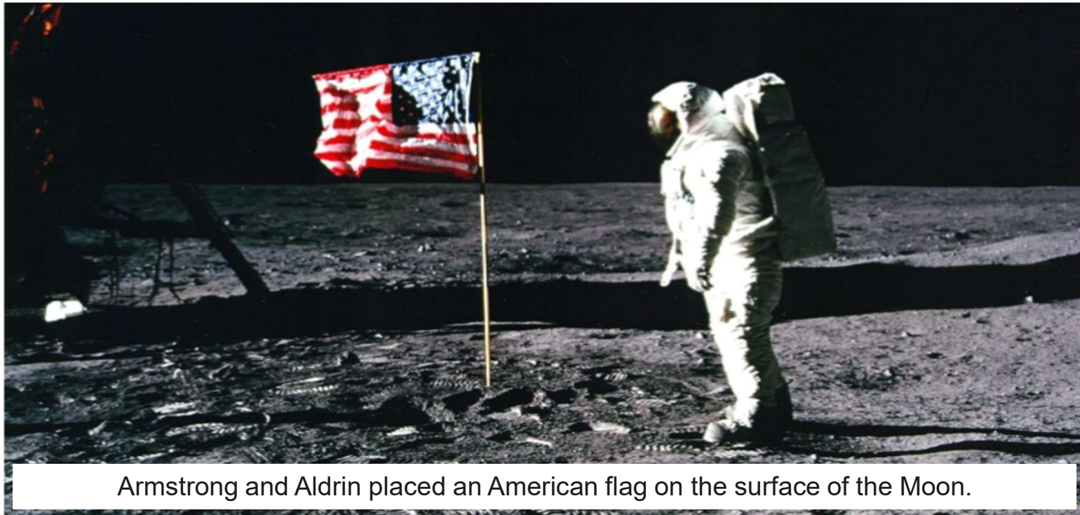
Armstrong and Aldrin placed an American flag on the surface of the Moon.

On July 20, 1969, Neil Armstrong became the first human to step on the moon. He and Aldrin walked around for three hours. They did experiments. They picked up bits of moon dirt and rocks. They put a U.S. flag on the moon. They also left a sign on the moon.