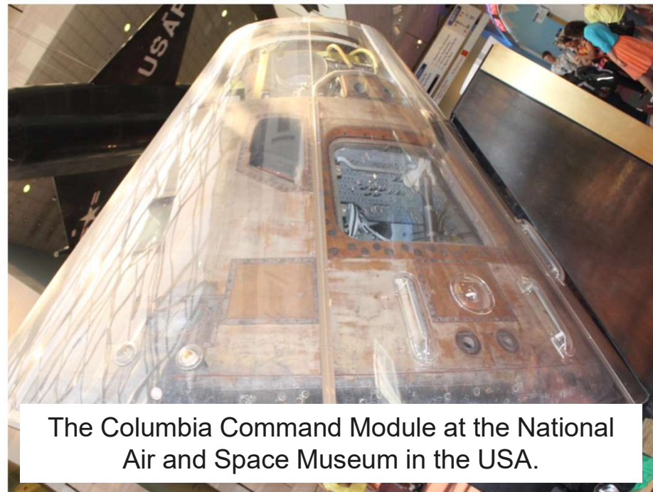
The Columbia Command Module at the National Air and Space Museum in the USA.