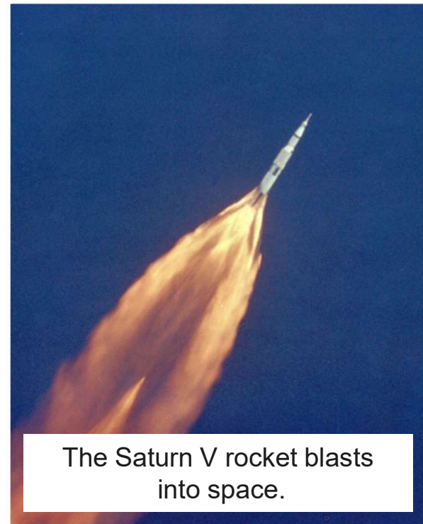
The Saturn V rocket blasts into space.