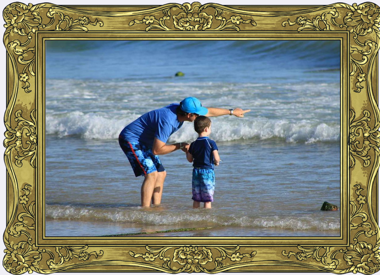
Photo courtesy of taniadimas(@pixabay.com) - granted under creative commons licence – attribution